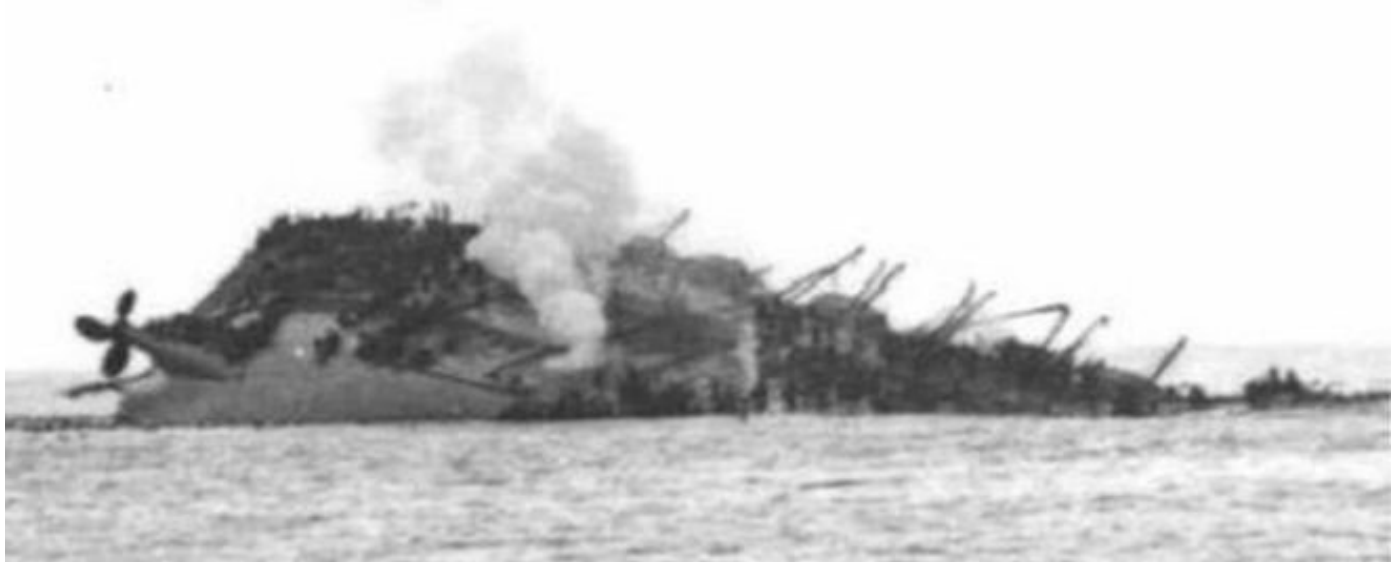
The SS Lancastria sinking off St Nazaire