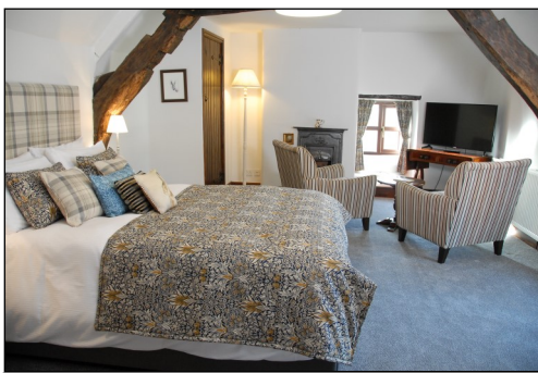
The Heritage Suite at the Royal George www.theroyaleorgecottingham.co.uk