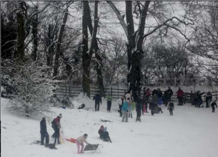
Snow pictures