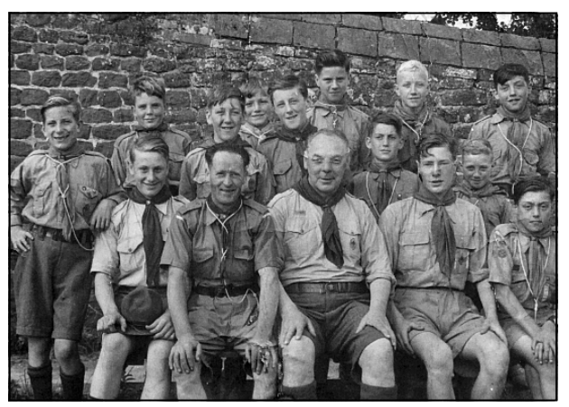
How it used to be! - Cottingham Scout Troop, 1949

Several youngsters from Cottingham and Middleton are members of the 1<sup>st</sup> Stoke Albany and Wilbarston Scouts and the troop has recently received a donation of £50 from Cottingham Parish Council. The Scouts welcome girls and boys between the ages of 10½ and 15, and the troop also have thriving groups of Cubs (8-10½ yrs) and Beavers (6-8 yrs) who meet on Thursdays and Mondays respectively.