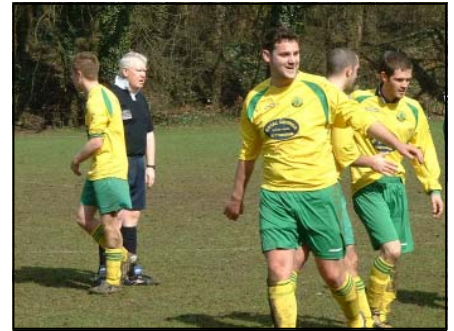
Adult team New Cottingham FC in action, sponsored by the Royal George. See their website at www.clubwebsite.co.uk/newcottinghamfc